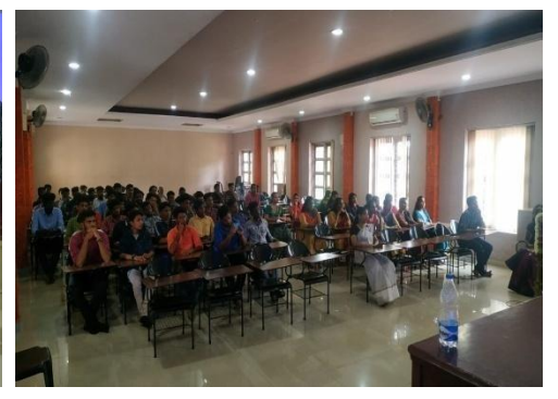
CARRIER GUIDANCE CLASS