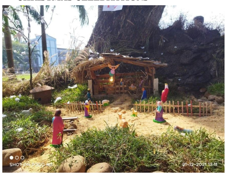
1 st PRIZE